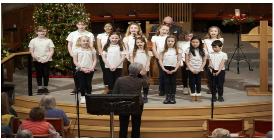
The Junior Singers in song at the Gift Service