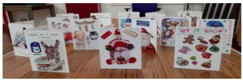
Our Christmas Cards