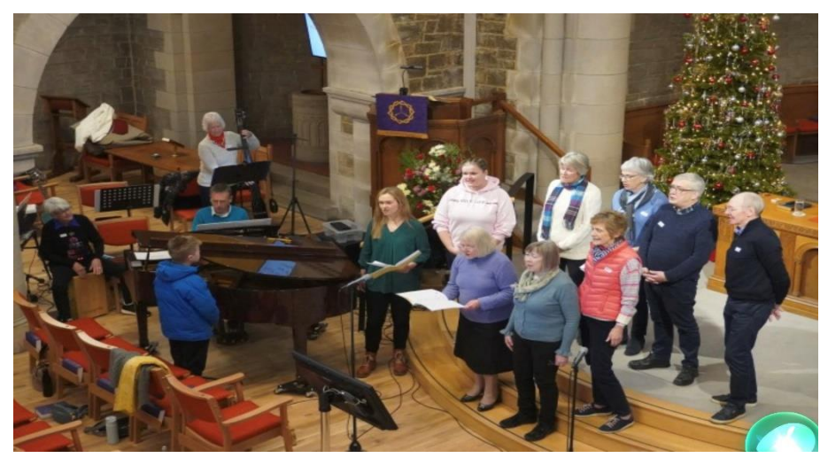
The Praise Group perform at the Gift Service

At the Gift Service we heard from two groups.