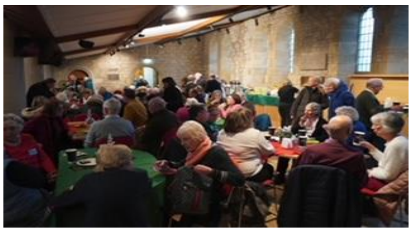
Coffee after the service