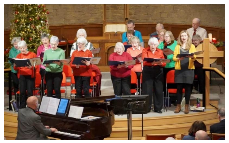
Carols with the Choir