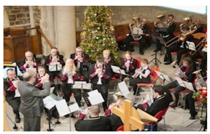
St. David's Brass Band