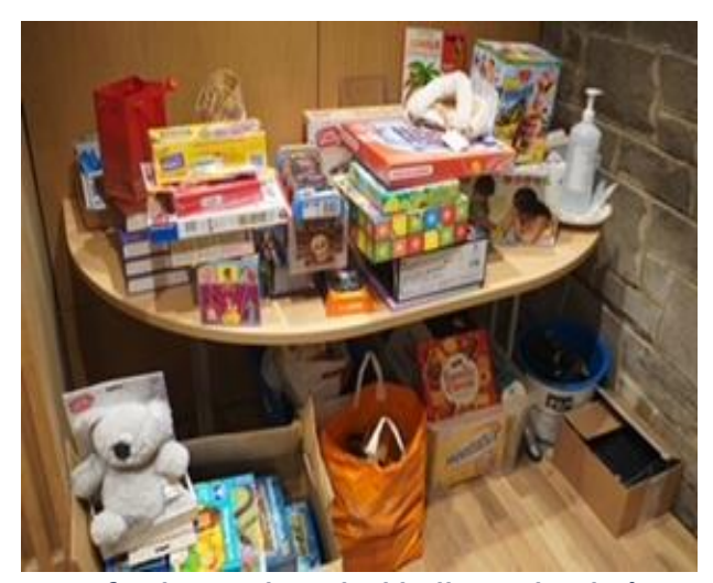
Gifts donated at Blackhall St Columba's