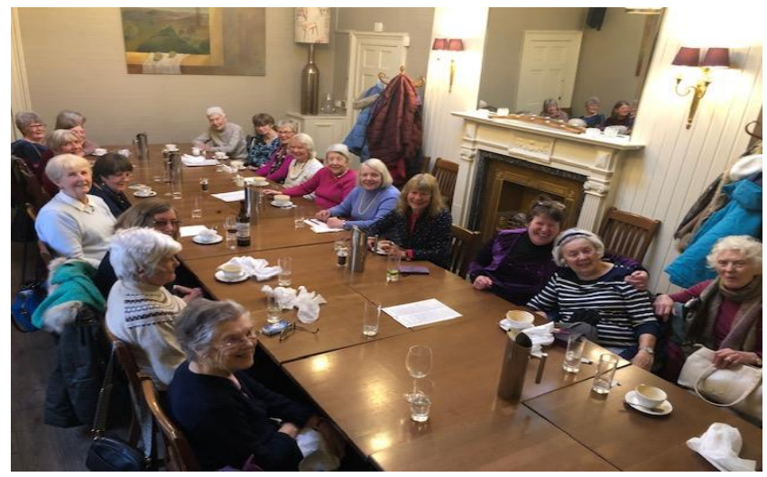
Tuesday Topics out for lunch