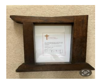
Design 1 - Designer