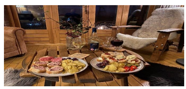
Time to socialise!

We have a book club in the church which meets roughly every five or six weeks. We discuss a book read by everyone and then we socialise more generally. We meet in the Church Sanctuary at 7.30pm and vary the day of the week that we meet to suit those attending. If anyone is interested in joining the group or finding out more about it, please contact Shona Cook (07981 970054).