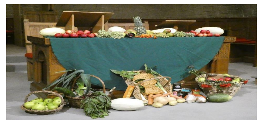
Our Harvest Table