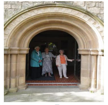
The Welcome Team