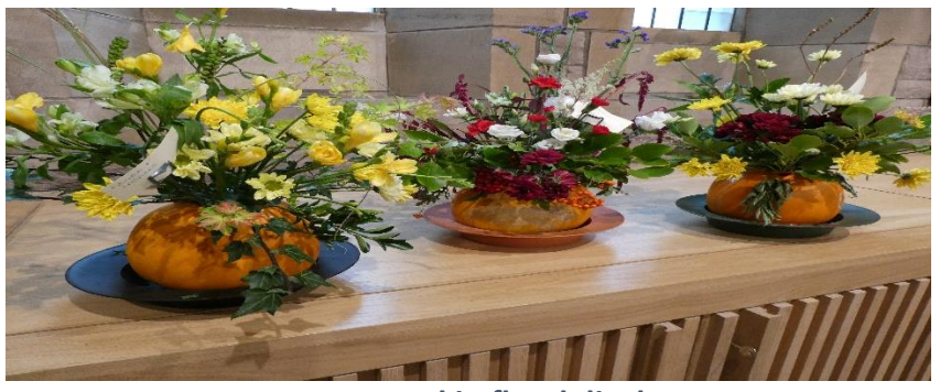
Pumpkin floral display