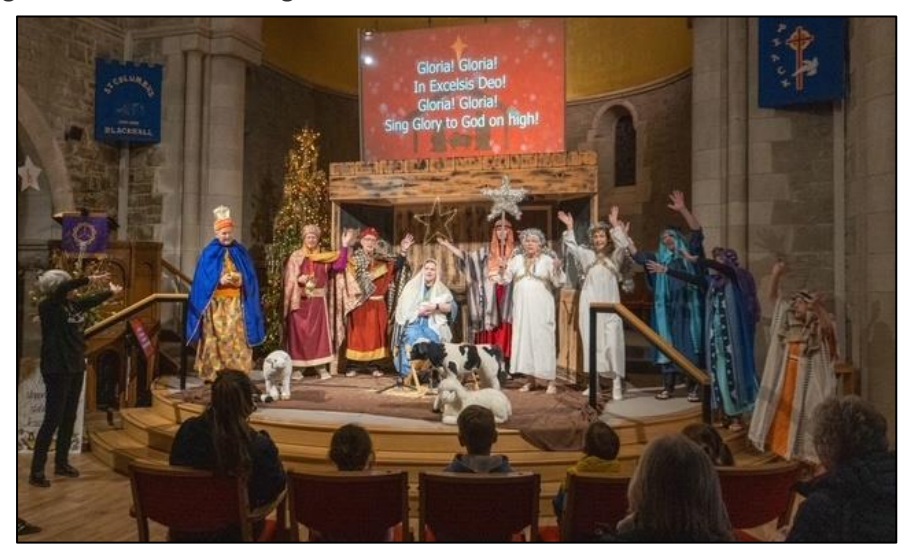
The Stable at the end of the trail

At the end of the trail, we reached the stable and found the most wonderful gift we have ever been given.