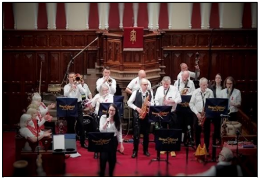
The Heart and Soul Band

The Heart and Soul Swing Band will perform on the 22nd of March at 7pm in the Sanctuary.