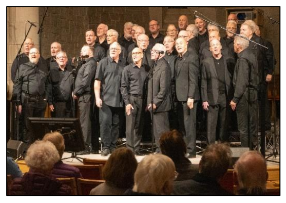
Father's Song at St Columba's

The audience of around 70 were thrilled by the whole evening and we no doubt she will succeed in her chosen career.