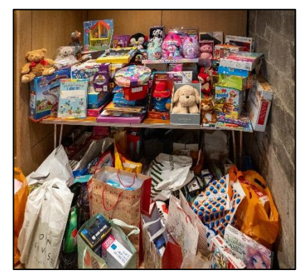
The gifts donated at the Gift Service

Here is an excerpt from his letter of thanks.