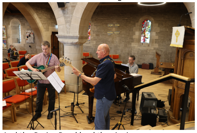
And the Praise Band lead the singing