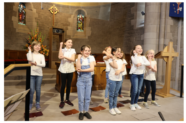
The Junior Singers get us all involved in the actions