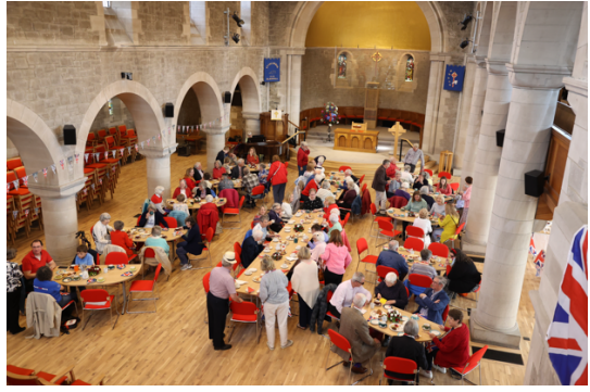
A great use of our flexible space